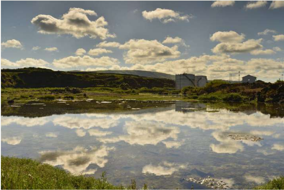
Figure 6. doi

Detail of the margin of Paul da Pedreira do Cabo da Praia during high tide (Photo by Paulo A.V. Borges).