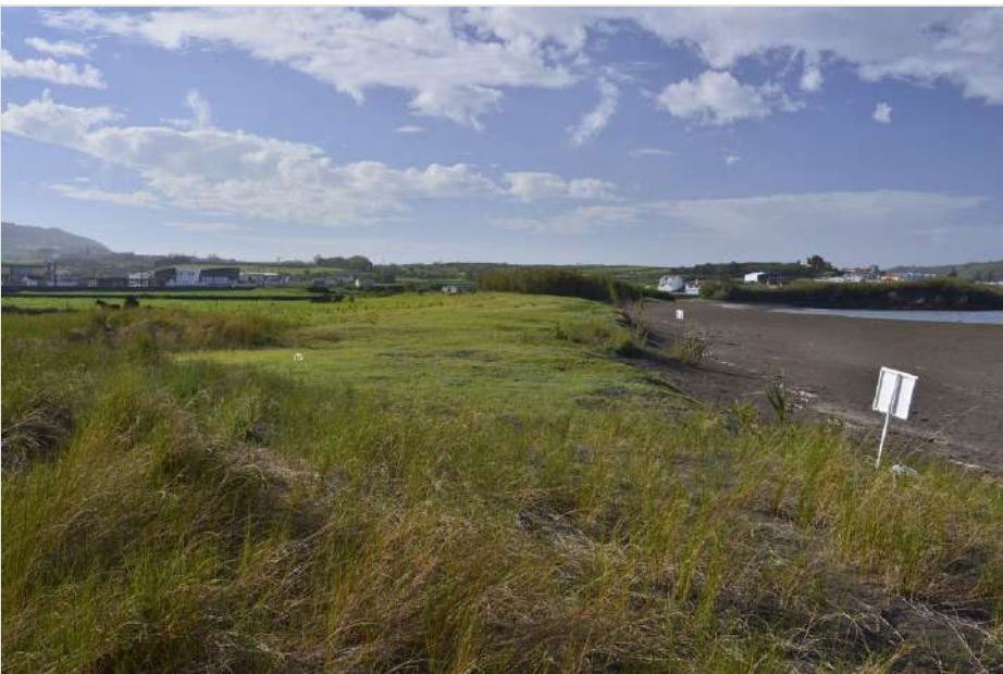
Figure 3. doi

Detail of the recently created "islands" of Juncus acutus in Paul da Praia da Vitória.