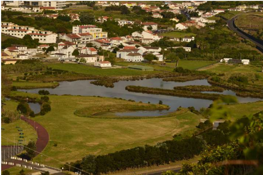
Figure 1. doi

Terceira Island is known for the presence of some very important native forest areas at high elevation (e.g., Gabriel and Bates 2005). However, few natural areas remain at lower elevations, notably in Praia da Vitória county. Three coastal wetland areas were studied in this project: Paul da Praia da Vitória (PPV) (Figs 1, 2), Paul do Belo Jardim (PBJ) (Figs 3, 4) and Paul da Pedreira do Cabo da Praia (PSCP) (Figs 5, 6).