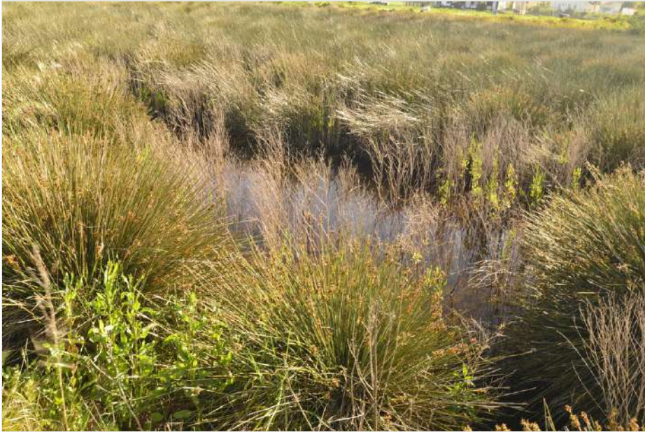
Figure 4. doi

Juncus maritimus growing in the Paul do Belo Jardim area.