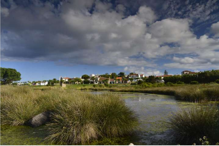
Figure 2. doi

Detail of the recently created "islands" of Juncus acutus in Paul da Praia da Vitória.