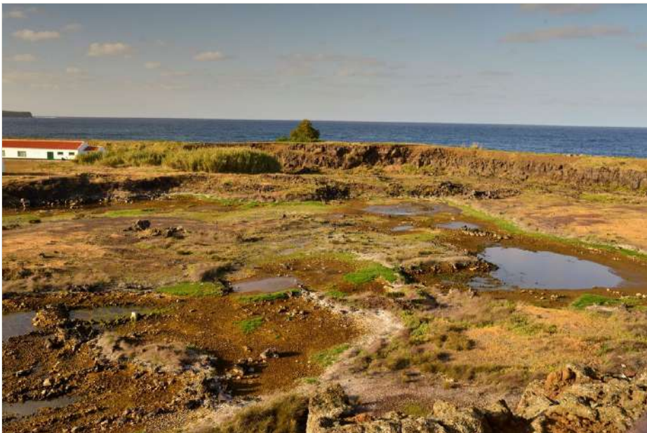
Figure 5. doi

Juncus maritimus growing in the Paul do Belo Jardim area.