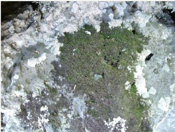
Figure 8. doi

A Macaronesian endemic liverwort ( Radula wichurae ) and an Iberian-Macaronesian liverwort ( Frullania azorica ; Fig. 8) were found growing on rocks in the different wetlands. Actually, Praia da Vitória county, parish of Cabo da Praia, represents the classical locality of Frullania azorica , the place from where the species was originally collected and described (Sim-Sim et al. 1995). This species is frequently found in the area, sometimes forming extensive colonies on exposed rocks near the ocean. However, in this study, it was not identified in Paul da Praia da Vitória, possibly because there are not many rocks available for colonization.